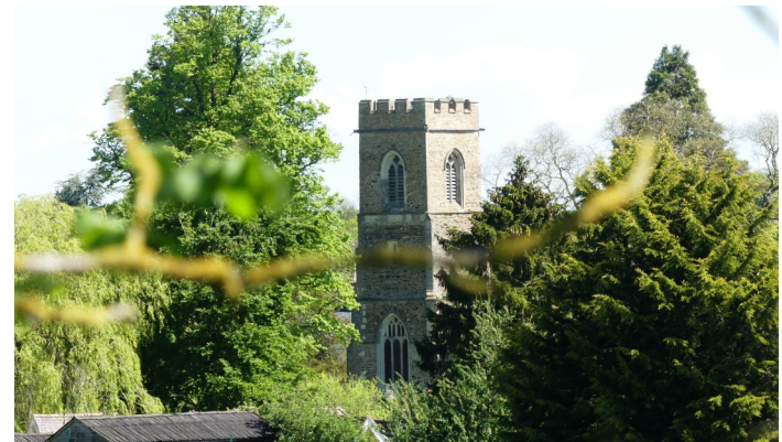
Little Gransden church—May 2019