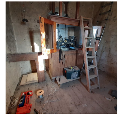
The clock undergoing the automatic winding upgrade