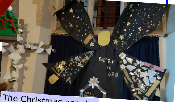
The Christmas angel