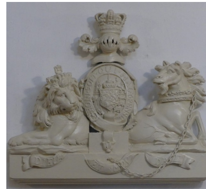
The newly painted coat of arms

As ever, we are grateful to all those who clean the church and keep it and the churchyard maintained.