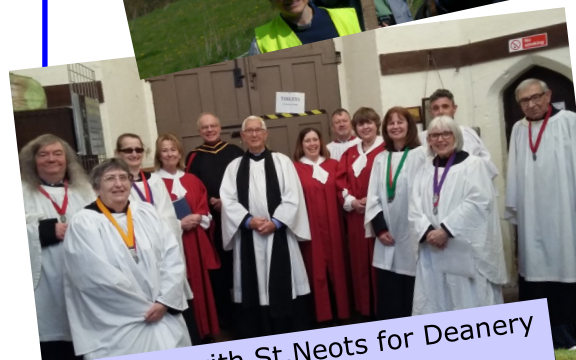
Joint choir with St. Neots for Deanery evensong