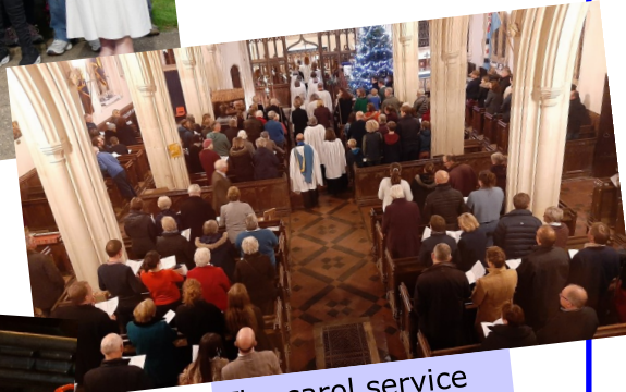
The carol service