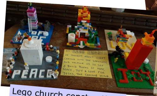
Lego church constructions