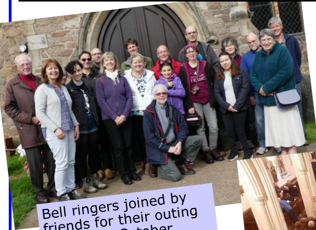
Bell ringers joined by friends for their outing to Leics in October