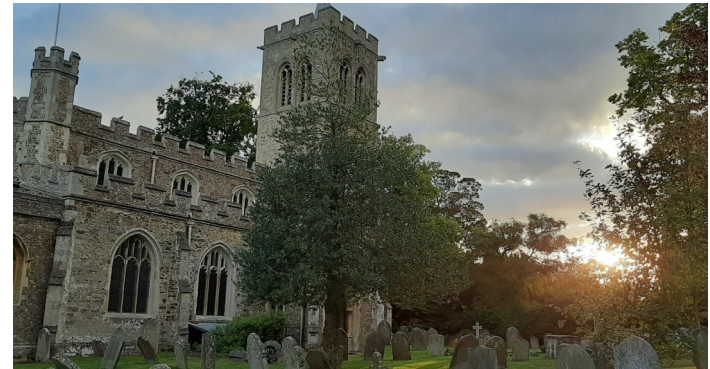
Great Gransden church—August 2019